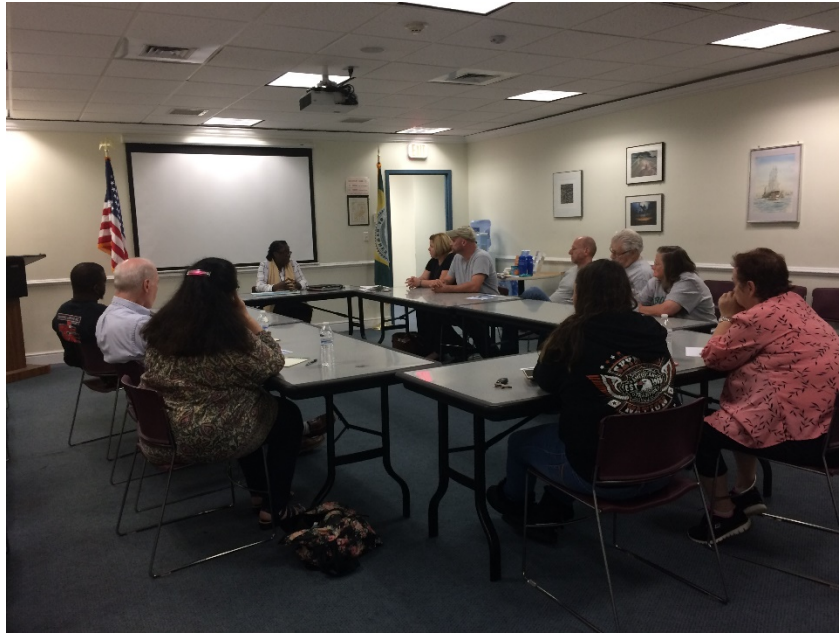
Solar for All Hamden Workshop 7.11.18